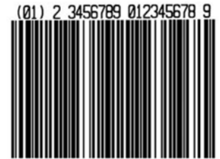
UCC/EAN Code 128